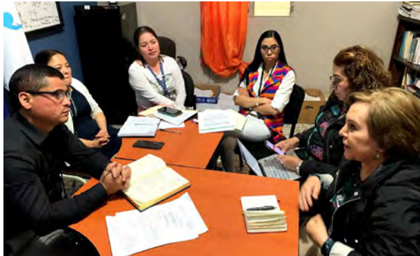
▲ JES experts meeting the National Police and the Public Prosecutor's Office in Honduras to discuss training needs to improve the investigation and prosecution of SGBV cases

A workshop was conducted with the judicial authorities to address the key findings of JES' initial diagnostic and to discuss the application of Conventionality Control for SGBV cases. JES also developed the curriculum and produced training tools for two courses on SGBV case preparation, evaluation and sentencing. The first train-the-trainer session and two replica events were held, reaching 71 judges, and a practical guide for applying Conventionality Control in SGBV cases was designed and finalized with participants during these sessions.