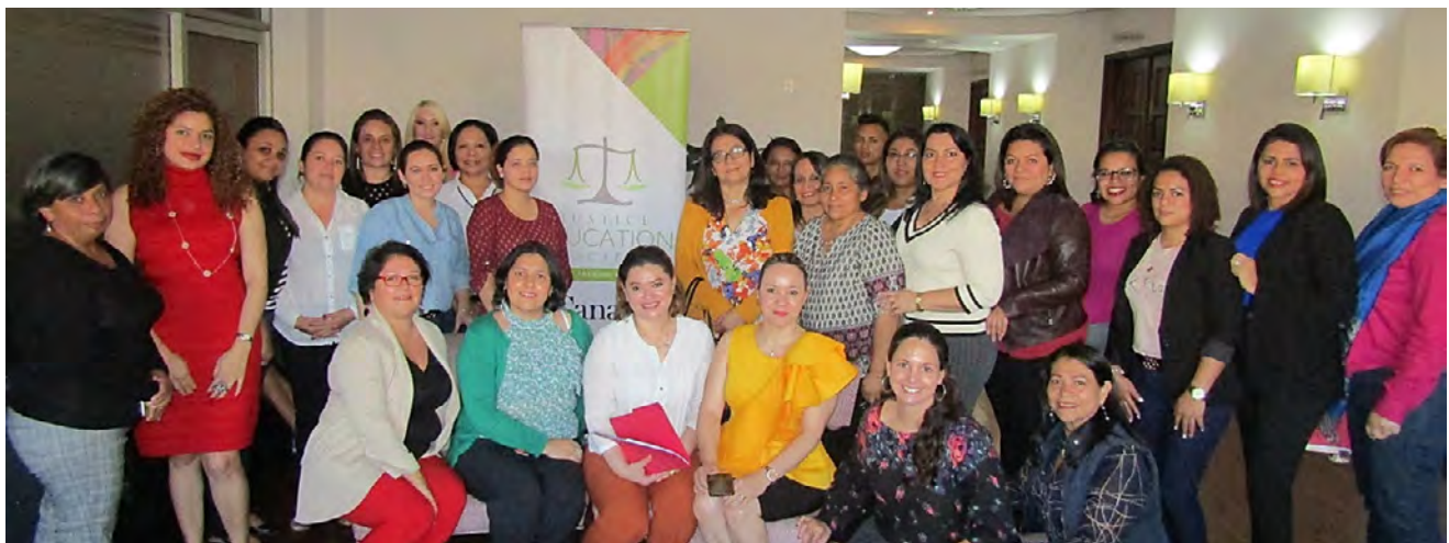
▼ JES coordination and operations workshop with gender-based victim services providers

Funded by Global Affairs Canada (GAC), the Justice for Victims of Sexual and Gender-Based Violence project (2018–2022) embarked on its second year with the signing of the Bilateral Agreement between the Government of Honduras and the Government of Canada. JES initiated its implementation plan, identifying critical local and international experts, signing an inter-institutional agreement with the Public Prosecutor's Office and securing collaboration agreements with civil society partners, such as the Women Studies Centre "Centro de Estudios de la Mujer" (CEM-H), victim help organization Visitación