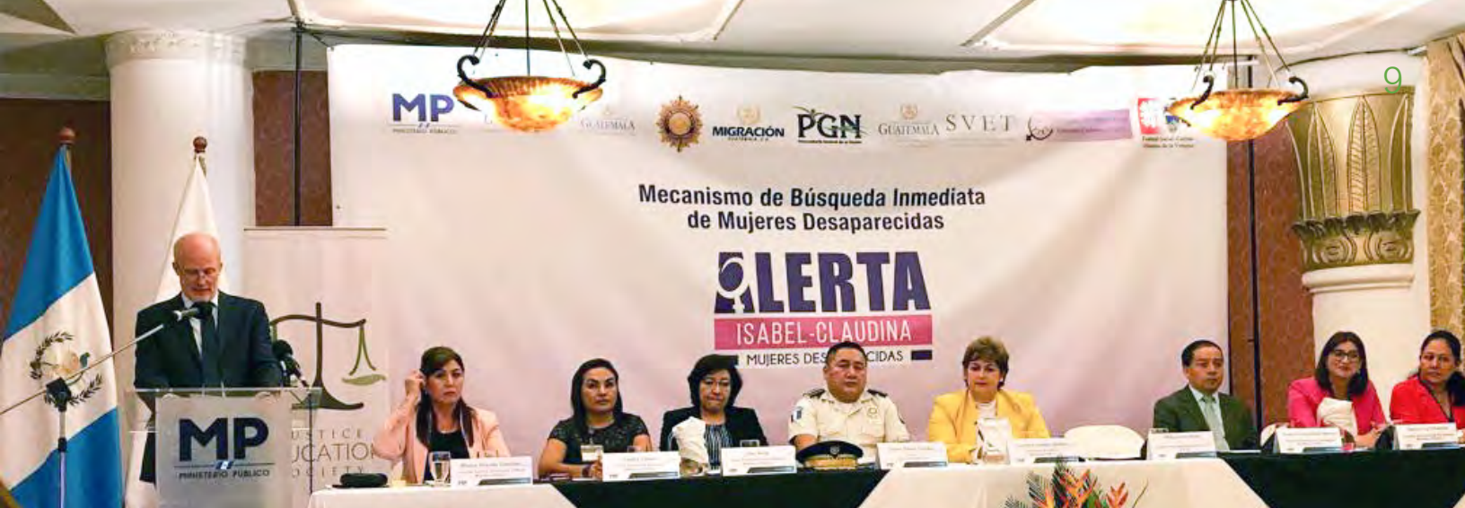
▲ Launch of the Missing Women’s Alert in Quetzaltenango, Guatemala