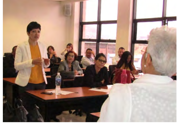
▲ Training of judges in the presentation, evaluation and sentencing of SGBV cases

Padilla and Cattrachas, an advocacy and support group for LGBTQI+ victims of crime.