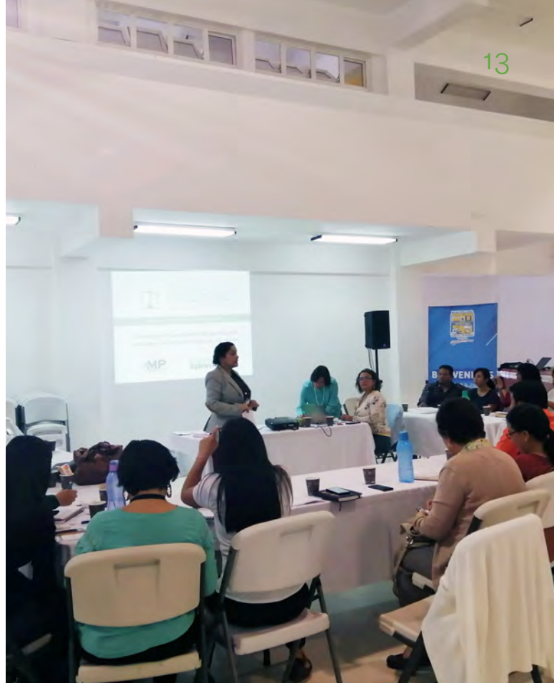
▲ JES Meeting with the Victims' Referral Networks and Organizations in Santa Catarina Pinula, Guatemala

To guarantee the engagement of its future users,