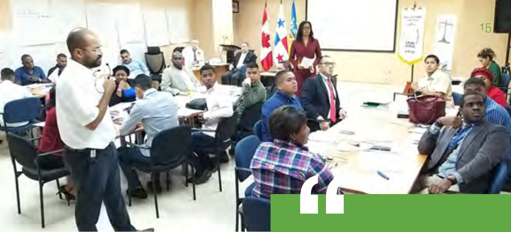
▲ JES Trial preparation course in Panama