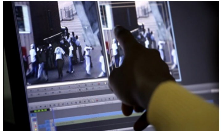
GPF Forensic Video Analysts compares images from a crime scene

Public engagement is critical for effective functioning of a criminal justice system. Public Service Announcements developed by JES have had more than 30,000 views on the Guyana Police Force Facebook page, reaching members of the public with important messaging on their role in the justice system.