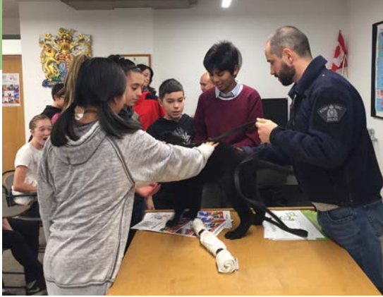
Klaus the police dog co-presented to a Grade 6 class from A. J. McLellan Elementary School.