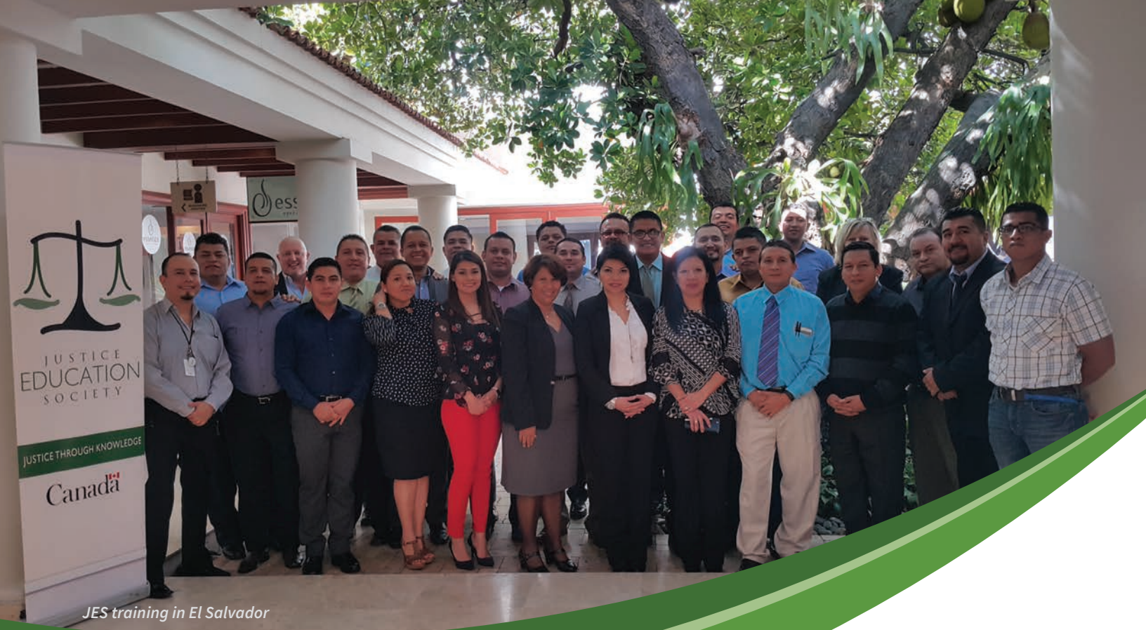
JES training in El Salvador