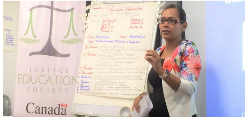
Participant in Major Case Management course presents to the group in Panama City.