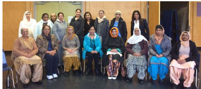
CIPI Workshop on Family Law & Domestic Violence for South Asian Women

Staff and volunteers helped more than 2500 new immigrants at courthouses in Vancouver and Surrey understand and gain confidence in Canada’s justice system, and prepare for court. Front-line services have been provided in Mandarin, Cantonese, Punjabi, Hindi, Spanish, French and Farsi.