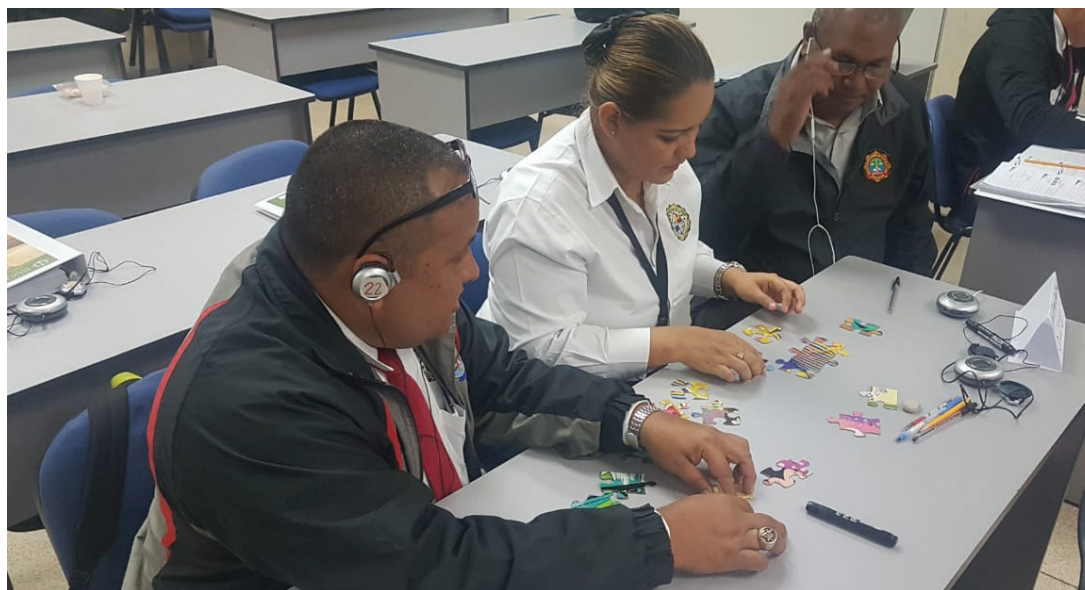
Participants work together in Criminal Intelligence Analysis Training, Panama City

JES conducted an institution-wide diagnostic of the Attorney General's Office in Guatemala on behalf of the Swedish International Development Agency and in August 2018 signed a four-year agreement to implement the project, with a value of approximately USD $9 million. The Guatemalan Institutional Justice Strengthening (GIJS) project will focus on four principal impact areas: Performance optimization in criminal case management; improved vulnerable victim services; better Indigenous and remote access; and capacity building within the Human Rights and Environmental Crimes offices, with women's empowerment an important cross-cutting theme. GIJS is JES's largest project to date, reflecting the strength of JES's reputation in Guatemala.